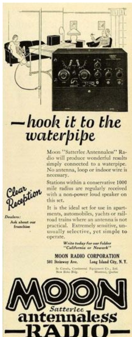
Satterlee Antennaless from Moon Radio Corp.