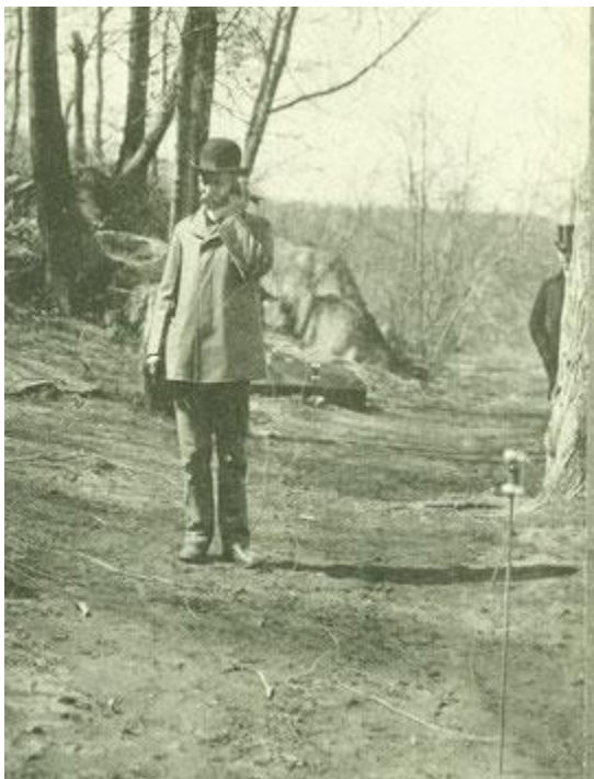
Nathan Stubblefield, receiving messages by Wireless

Other researchers corroborated the fact that usable amounts of current could actually be derived from the ground, currents whose powerful displays permitted the elimination of battery cups and generators. The failure of all reductive electrical models to satisfactorily address these energetic characteristics became especially evident with the development of the "earth batteries", an outgrowth of these telegraphic observations (Bain, 1849). These simple material composites, made to be buried in earth, produced currents not explained through electrolytic action. Small buried earth batteries developed sufficient power to charge storage batteries. They were also employed to provide telegraphic (Bryan, Cerpaux, Dieckmann, Jacques, Bear), and later telephonic systems (Stubblefield, Strong, Brown, Tomkins, Lockwood) with uninterrupted operating power. Neither decomposing nor failing with months of buried use, the mysterious earth batteries contain an essential mystery which electrodynamic models cannot adequately explain.