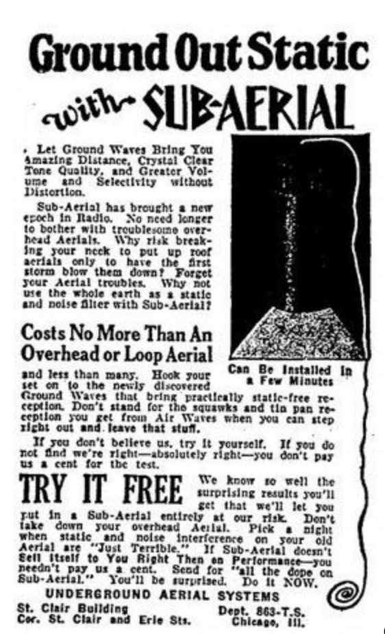
Ground Out Static with SUB-AERIAL

theory was developed to "explain" the superior operation of the Beverage Aerial. [All of these patents and articles are found in Vril Compendium Volumes 9 and 10].